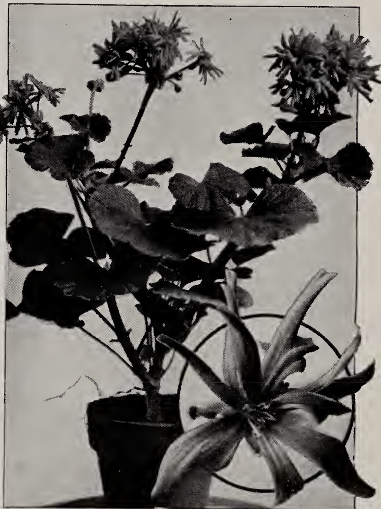
Geranium, Karen Buus

An entirely new type of Geranium of our own production, and something absolutely distinct. It is a dazzling bright red, with curled and twisted petals about one-eighth inch wide and up to 1 inch long, making immense flowers as much as 2 inches across or more. The whole appearance of the flower is not unlike a poinsettia. Beautiful, distinct leaves. Strong plants from 2½-in. pots, 75 cts. each, $2.00 for 3; from 4½-in. pots, $1.25 each, $3.00 for 3.